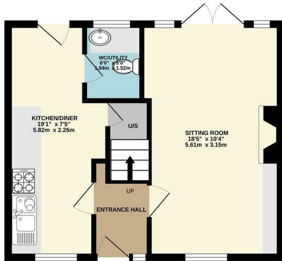
GROUND FLOOR 388 sq.ft. (36.1 sq.m.) approx.